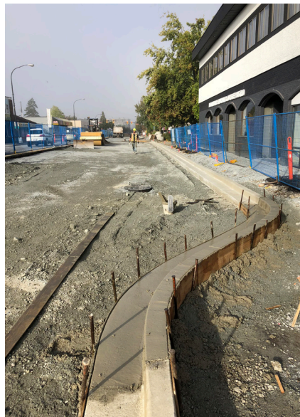
Finished curb on the north side of Lougheed Highway between 224 and 225 Street.