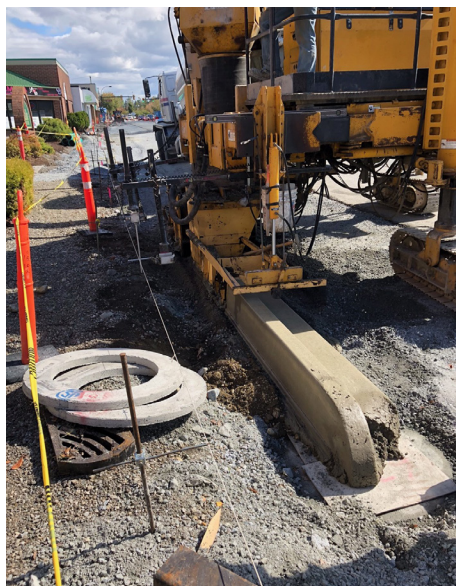
Pouring curb along the north side of Lougheed Highway from 225 Street heading east.