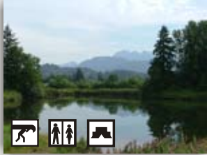
View of the South Alouette River