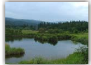
Stroll through the neighbourhood