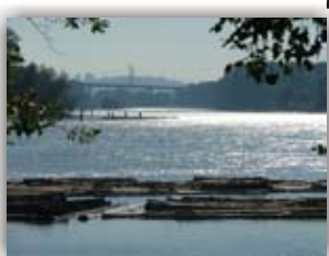
Take in the view of the Fraser River