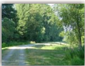
Wooded trails along the dyke