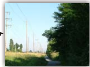
Mtn. view trail along Loughheed Hwy