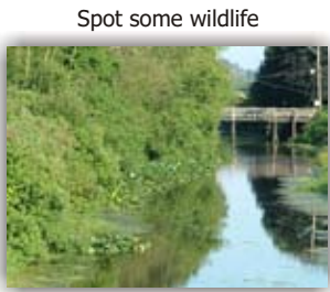
Spot some wildlife