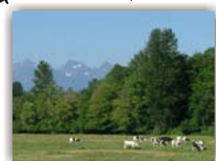
Cows in the pasture