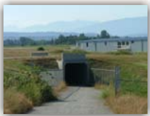
Walking through the underpass