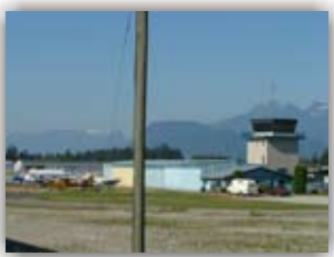
Pitt Meadows Airport