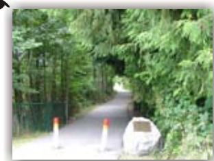
Take in some magic of the forest